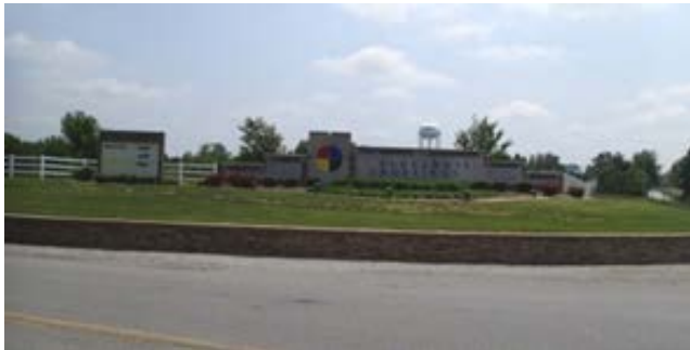
Bluegrass Crossings Regional Business Centre entrance at Old Liberty Church Road intersection with US 231

The Bluegrass Crossings Regional Business Centre Improved Access Road Study looks at ways to improve accessibility, safety, and mobility for the Bluegrass Crossings Regional Business Centre traffic. The business center is located in Ohio County, Kentucky.