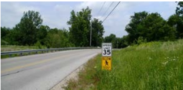
Old Liberty Church Road approaching the business center

Over a four year analysis period from February 2010 to January 2014, there were six reported crashes along the Old Liberty Church Road. All six were property damage only crashes and none involved a semi-truck or school bus. Four were single vehicle collisions, one was a rear end collision and one was a sideswipe. Along the study corridor, one spot was found to have a critical rate factor (CRF) greater than 1.00. This spot, located at the US 231/Old Liberty Church Road intersection, had a CRF of 1.68. This is likely due to the deficient vertical curve at this location and the skew of the intersection. At this high crash spot there were nine total crashes; three were injury crashes and six were property damage only crashes. Six were single vehicle collisions, two were rear end collisions and one was a sideswipe collision.